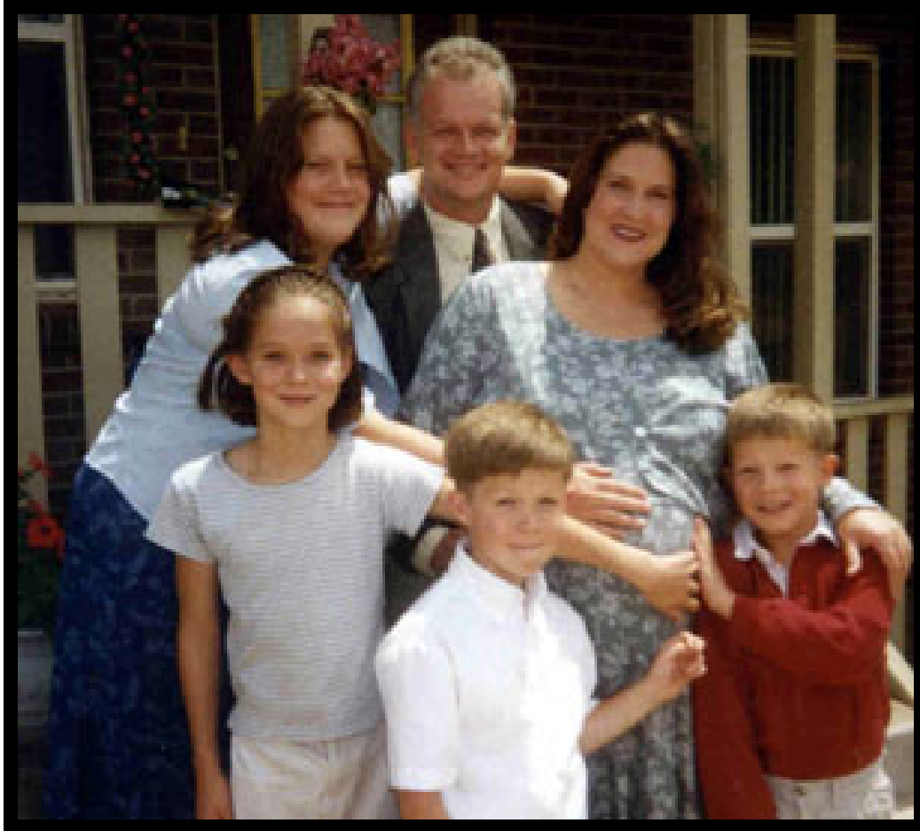
My older children were very excited about the baby!