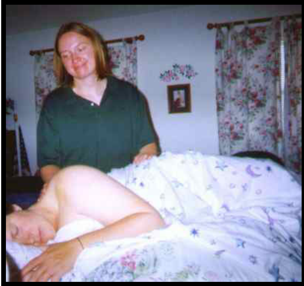
My therapist would set up her table in my bedroom.