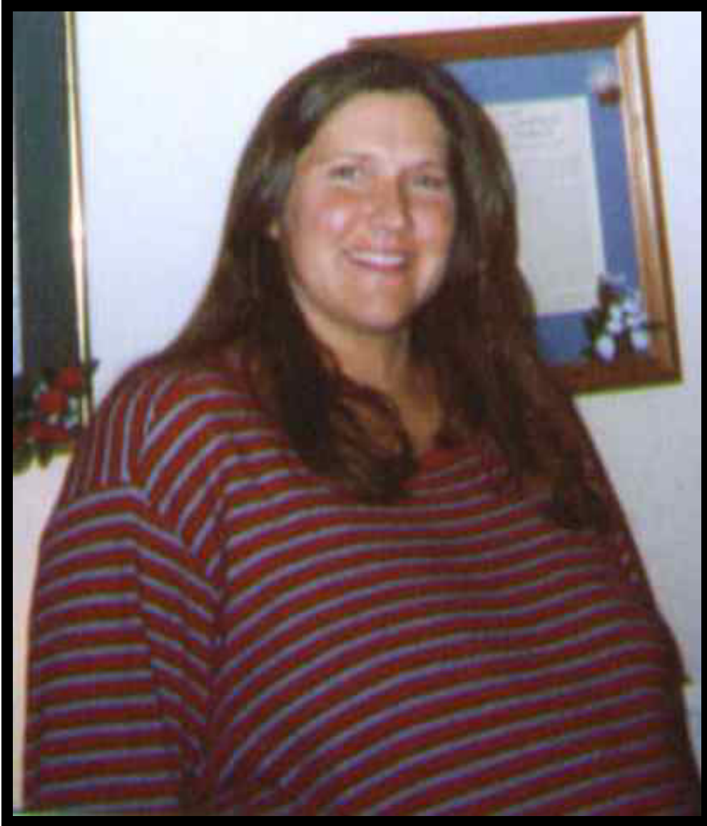
Photograph taken the day of the birth – about six hours before I went into labor.