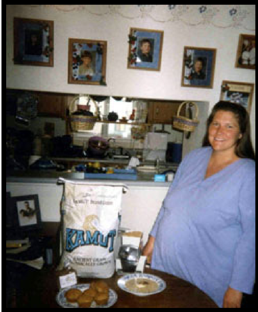
The main food I ate during this pregnancy was organic Kamut Grain, A Non hybrid form of wheat.