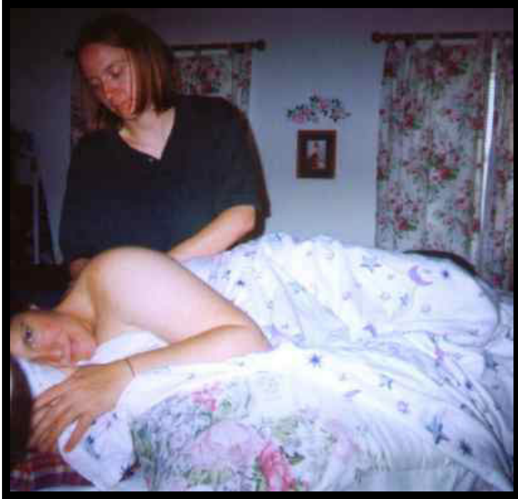
Prenatal Massage was my main prenatal care!