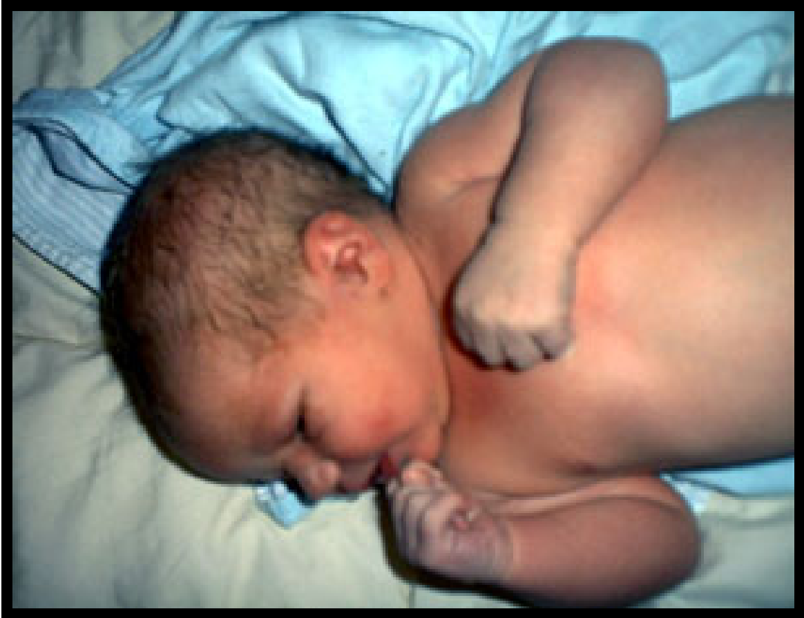
Ben – a few minutes after being born